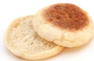
English muffin 英式瑪芬 為下方扁平、有一層粉的麵包，常與班尼迪克蛋搭配；muffin 也可以是甜點瑪芬蛋糕的意思。