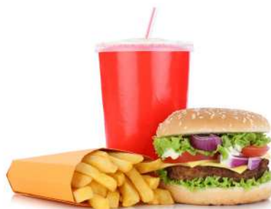
meal deal / set meal / combo 套餐