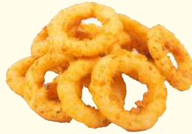
onion rings 洋蔥圈