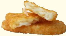
hash brown 薯餅