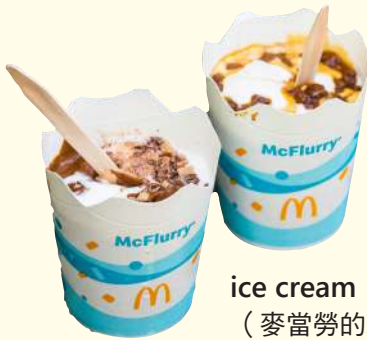
ice cream (麥當勞的冰炫風稱為 McFlurry)