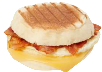
egg muffin sandwich with bacon and cheese 英式瑪芬蛋堡夾培根和起司