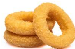
onion rings 洋蔥圈