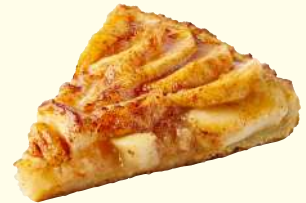
apple pie 蘋果派