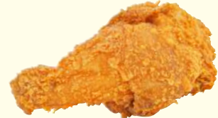
fried chicken 炸雞 (麥當勞的麥脆雞稱為 McCrispy Chicken)