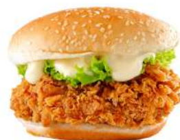
crispy chicken burger 酥脆雞肉堡