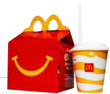
kid's meal 兒童餐

5 How many pieces of fried chicken chicken nuggets would you like?